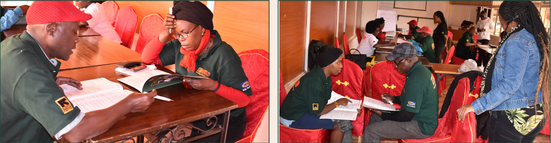
Left: Mentors during a training session in Kawangware, Nairobi (Right) an IRC staff with mentees during an information session

A Randomized Control Trial (RCT) involving 4,000 aspiring micro entrepreneurs and mentors in Nairobi, Kenya was launched September 2022. The RCT is an important component of the evidence and learning pillar in the Re:Build program. The Nairobi RCT involves 2,000 aspir-