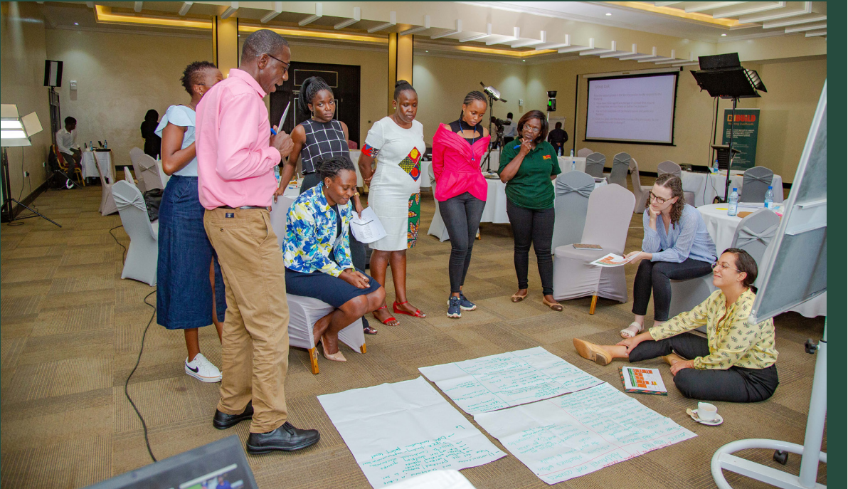
A group discussion during the Programme Learning Conference

program implementation. The planning meeting brought together teams from Kampala, Nairobi, and New York. Recommendations from the meeting fed into the planning for the third year of the Re:Build program.