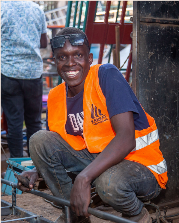
A South Sudanese refugee under a Re:Build apprenticeship placement to improve skills in welding.